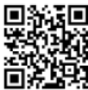
Yuma County Fair Webpage

https://co4h.colostate.edu/statefair/StateFairExhibitReq.pdf , The Yuma County Extension Office or scan the QR Code below